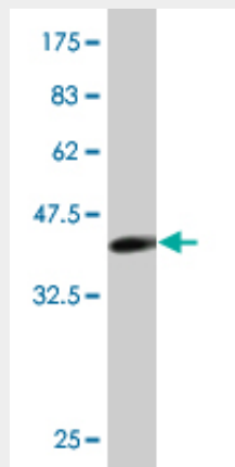
Antibody Reactive Against Recombinant Protein. Western Blot detection against Immunogen (33.77 KDa) .