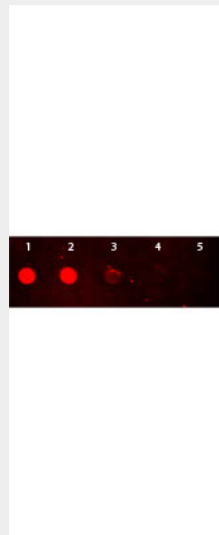
Dot Blot of Rhodamine Conjugated Goat-anti-Rabbit IgG. Antigen: Rabbit IgG. Load: Lane 1 - 50ng Lane 2 - 16.67ng Lane 3 - 5.56ng Lane 4 - 1.85ng Lane 5 - 0.62ng. Primary antibody: none. Secondary antibody: Rhodamine Conjugated Goat-a-Rabbit IgG secondary antibody at 1:1,000 for 60 min at RT. Block: MB-070 for 60 min at RT.