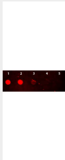
Dot Blot of Rhodamine Conjugated Goat-anti-Rabbit IgG. Antigen: Rabbit IgG. Load: Lane 1 - 50ng Lane 2 - 16.67ng Lane 3 - 5.56ng Lane 4 - 1.85ng Lane 5 - 0.62ng. Primary antibody: none. Secondary antibody: Rhodamine Conjugated Goat-a-Rabbit IgG secondary antibody at 1:1,000 for 60 min at RT. Block: MB-070 for 60 min at RT.