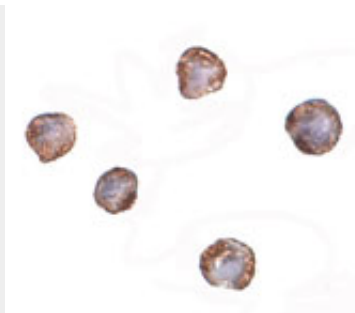
Immunocytochemistry of XBP-1 in HepG2 cells with XBP-1 antibody at 2 µg/mL.