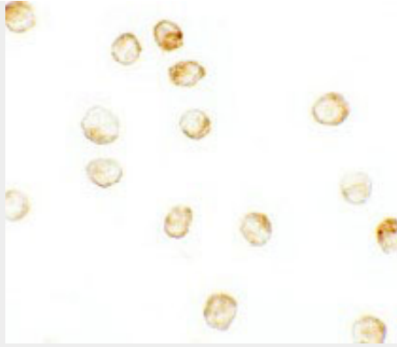
Immunocytochemistry of JMJD3 in K562 cells with JMJD3 antibody at 2.5 µg/mL.