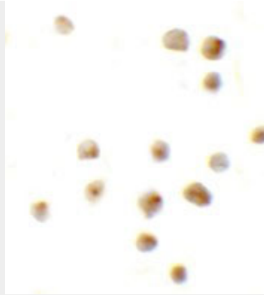
Immunocytochemistry of EZH2 in 293 cells with EZH2 antibody at 10 µg/mL.