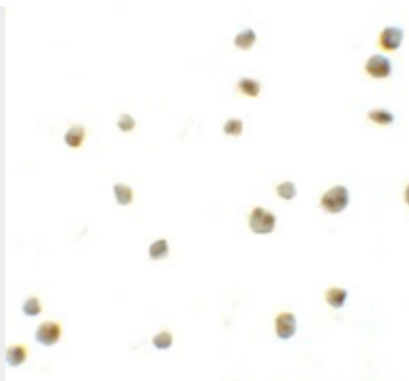
Immunocytochemistry of DYRK2 in 293 cells with DYRK2 antibody at 10 µg/mL.