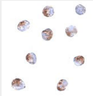
Immunocytochemistry of PDCD5 in Jurkat cells with PDCD5 antibody at 2 µg/mL.