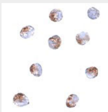
Immunocytochemistry of PDCD5 in Jurkat cells with PDCD5 antibody at 2 µg/mL.