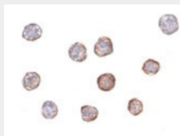
Immunocytochemistry of Actin in HeLa cells with Actin antibody at 2 \mu g/mL.