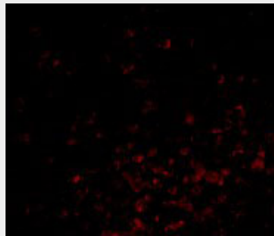
Immunofluorescence of BAG-1 in Human Lymph Node cells with BAG-1 antibody at 20 µg/mL.