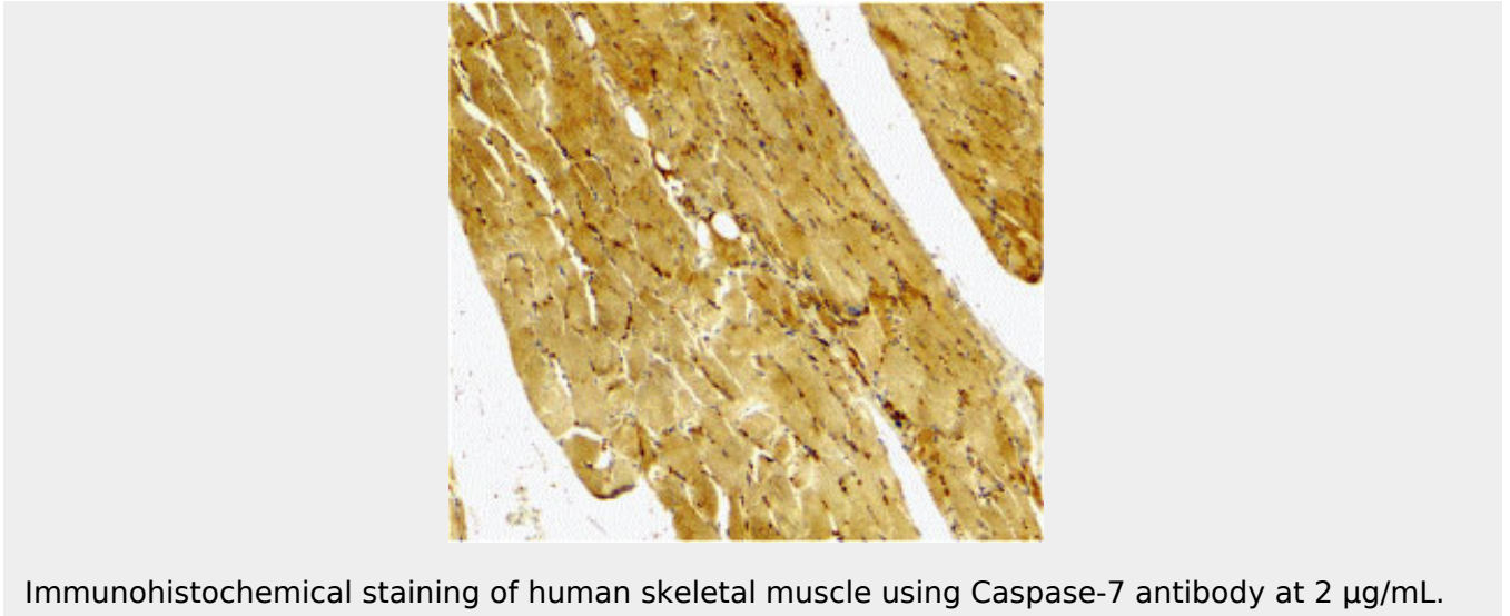
Immunohistochemical staining of human skeletal muscle using Caspase-7 antibody at 2 µg/mL.