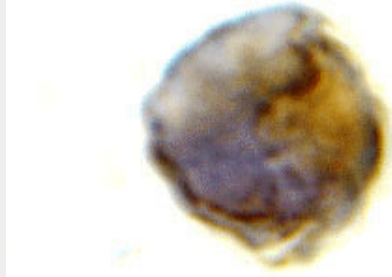
Immunocytochemistry of TLR8 in Daudi cells with TLR8 antibody at 2 µg/mL.