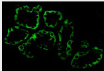
Immunofluorescence of ACE2 in Human Kidney cells with ACE2 antibody at 2 \mu g/mL.