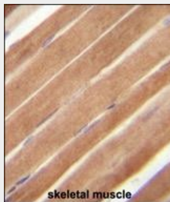
EphB2 Antibody (N-term)(Cat. #AP7623A)immunohistochemistry analysis in formalin fixed and