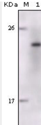
Figure 1: Western blot analysis using FES mouse mAb against truncated FES recombinant protein.