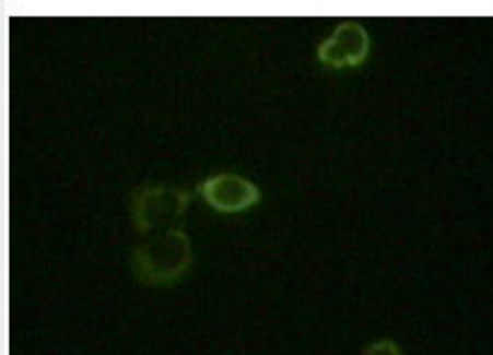
Figure 2: Immunofluorescence staining of methanol-fixed HeLa cells using ABL2 mouse mAb showing cytoplasm localization.