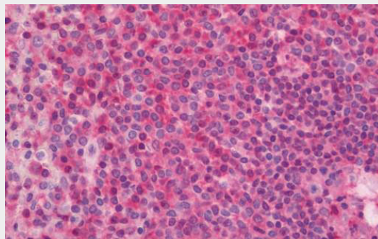
Human Spleen: Formalin-Fixed, Paraffin-Embedded (FFPE)