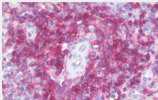
Anti-CD44 antibody IHC staining of human spleen.