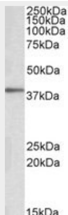
PRKCDBP antibody (0.1 ug/ml) staining of Human Adipose cell lysate (35 ug protein/ml in RIPA buffer).