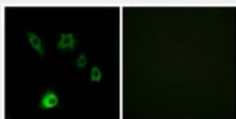
Immunofluorescence of HUVEC cells, using FGF18 Antibody.