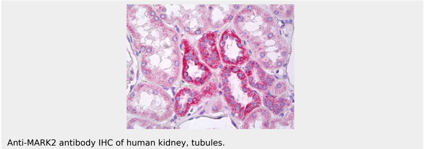
Anti-MARK2 antibody IHC of human kidney, tubules.