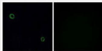
Immunofluorescence of A549 cells, using CXCR4 Antibody.