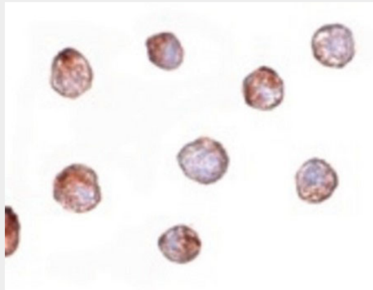
Immunocytochemistry of Fibulin 3 in HeLa cells with Fibulin 3 antibody at 20 ug/ml.