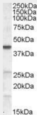
ABHD5 (0.2 ug/ml) staining of NIH3T3 lysate (35 ug protein in RIPA buffer).