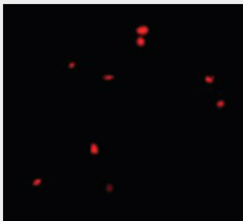
Immunofluorescence of CIDE-B in Human Small Intestine cells with CIDE-B antibody at 20 ug/ml.