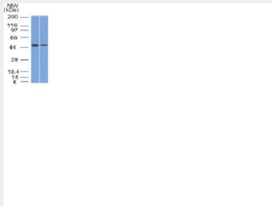
Western Blot Analysis (A) MCF-7 (B) PC3 Cell lysate Using FOXA1 Monoclonal Antibody (FOXA1/1512)