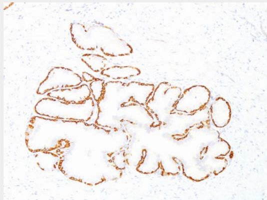
Formalin-fixed, paraffin-embedded human Prostate Carcinoma stained with Cytokeratin 14 Monoclonal Antibody (SPM263).