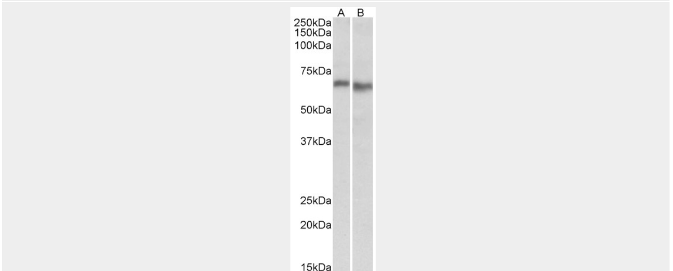
AF3301a (0.3 \mu g/ml) staining of Mouse (A) and Rat (B) Heart lysate (35 \mu g protein in RIPA buffer). Detected by chemiluminescence.