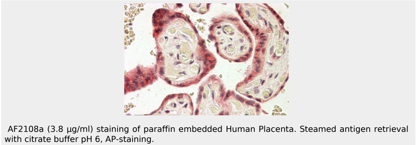
AF2108a (3.8 µg/ml) staining of paraffin embedded Human Placenta. Steamed antigen retrieval with citrate buffer pH 6, AP-staining.