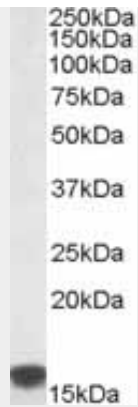
AF1951a (0.5 \mu\text{g/ml} ) staining of Human Peripheral Mononucleocytes lysate (35 \mu\text{g} protein in RIPA buffer). Primary incubation was 1 hour. Detected by chemiluminescence.