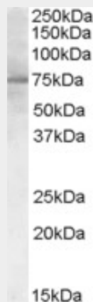
AF1799a (0.3 µg/ml) staining of Human Adipose lysate (35 µg protein in RIPA buffer). Primary incubation was 1 hour. Detected by chemiluminescence.