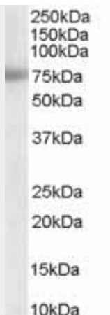
AF1688a staining (0.03 \mu\text{g/ml} ) of Human Placenta lysate (RIPA buffer, 35 \mu\text{g} total protein per lane). Primary incubated for 1 hour. Detected by chemiluminescence.