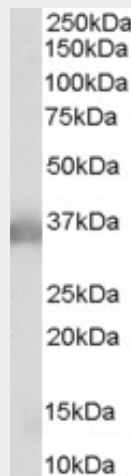
AF1082a (0.1 µg/ml) staining of Human Brain lysate (35 µg protein in RIPA buffer). Primary incubation was 1 hour. Detected by chemiluminescence.