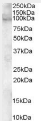
AF1025a staining (0.1 µg/ml) of human heart lysate (RIPA buffer, 30 µg total protein per lane).