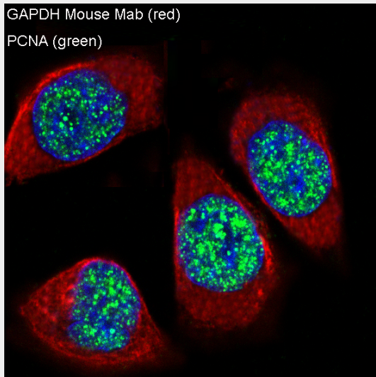
Immunofluorescent analysis of Hela cells, using GAPDH Mouse Monoclonal Antibody.