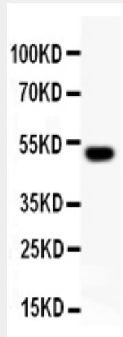
Anti-RUNX2 Picoband antibody, ABO11855-1.jpg All lanes: Anti RUNX2 (ABO11855) at 0.5ug/ml WB: Recombinant Human RUNX2 Protein 0.5ng Predicted bind size: 50KD Observed bind size: 50KD