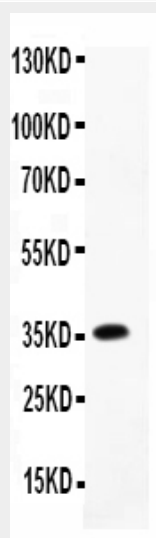
Anti-CNTF Picoband antibody, ABO11756-3.jpgAll lanes: Anti-CNTF(ABO11756) at 0.5ug/mlWB: Recombinant Mouse CNTF Protein 0.5ngPredicted bind size: 36KDObserved bind size: 36KD