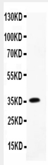
Anti-CNTF Picoband antibody, ABO11756-3.jpg All lanes: Anti-CNTF (ABO11756) at 0.5ug/ml WB: Recombinant Mouse CNTF Protein 0.5ng Predicted bind size: 36K Observed bind size: 36K