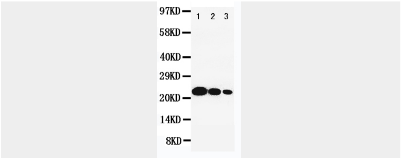
Anti-IL-6 antibody, ABO11011, Western blotting Lane 1: Recombinant Human IL-6 Protein 10ng Lane 2: Recombinant Human IL-6 Protein 5ng Lane 3: Recombinant Human IL-6 Protein 2.5ng