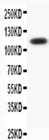
Anti-Progesterone Receptor antibody, ABO10735, Western blottingWB: HELA Cell Lysate