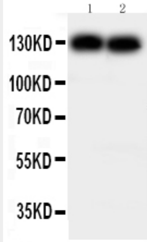
Anti-N Cadherin antibody, ABO10654, Western blotting Lane 1: MCF-7 Cell Lysate Lane 2: HELA Cell Lysate