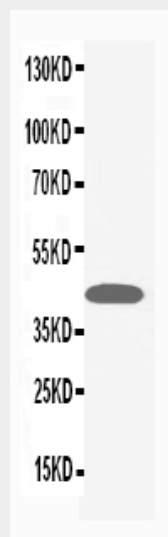
Anti-MAPK1/3 antibody, ABO10535, Western blottingWB: HELA Cell Lysate